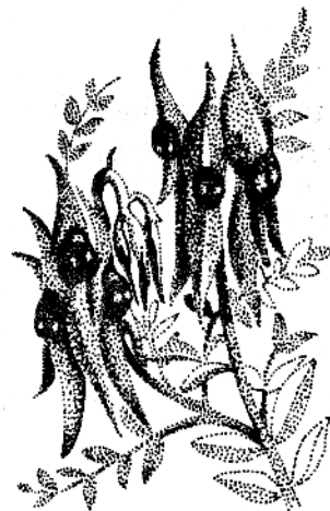
Sturt Desert Pea

A. Now, I take the first street on the left, then the third one on the right. Sorry, I've forgotten what comes next. Would you mind _____ over it just once more?